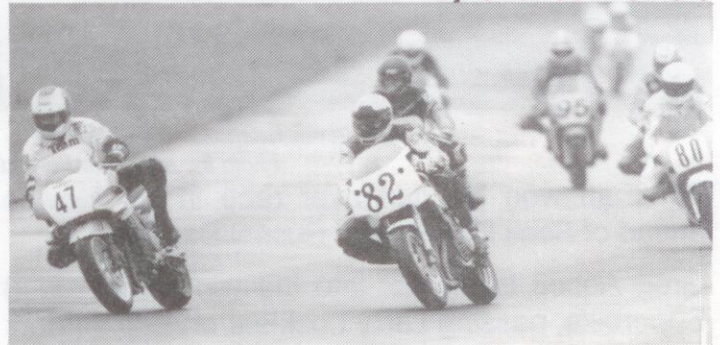
Superstock action at Texas World.