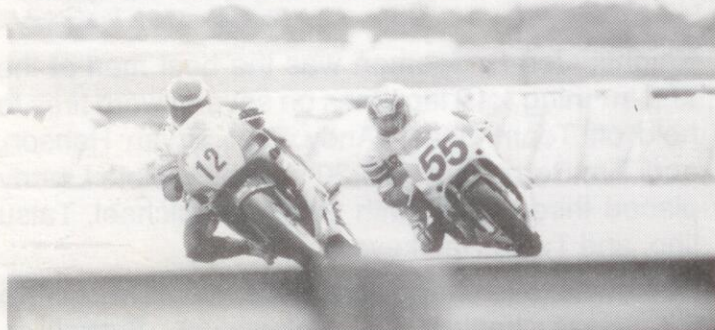
The Noble Knights (#55) on their way to their first overall win.