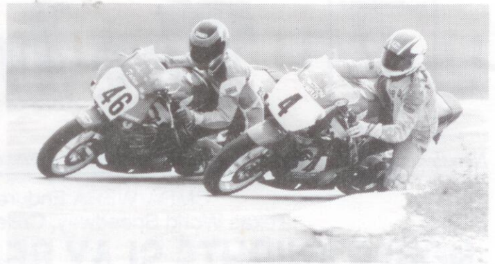
#46 Moto Liberty and #4 Team Scream.